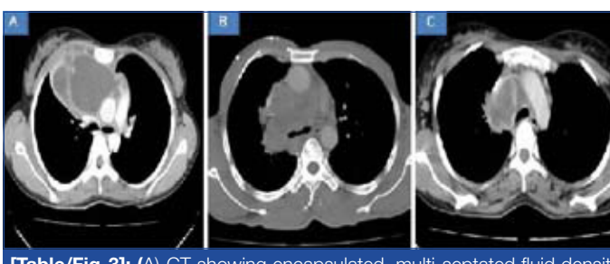
[Table/Fig-3]: (A)-CT showing encapsulated, multi-septated fluid density lesion in the anterior mediastinum measuring about 9.5 x 6.5 cms. (Teratoma) (B)-CT showing lobulated mass lesion measuring 12.5 x 7.5 x 6.6 cms in the anterior and middle mediastinum. (NHL) (C)-CT showing peripherally enhancing conglomerate lymph nodes with central necrosis in the midline and right paramedian region compressing superior vena-cava and encasing trachea. (Mediastinal tuberculosis)